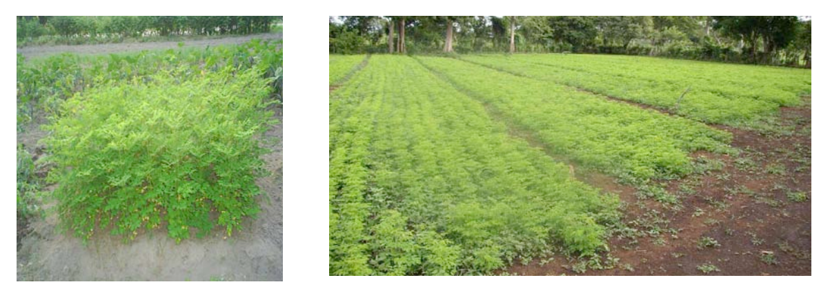
Fig. 3. 5x15cm spacing

calculated by dividing 10,000 with the spacing being used in meters. For example 10x10cm (0.1m x 0.1m) spacing gives a plant population or seed rate of one million plants per hectare i.e. 10,000/ 0.1m x 0.1m. High density monocropping of moringa gives the highest leaves yields per unit area.