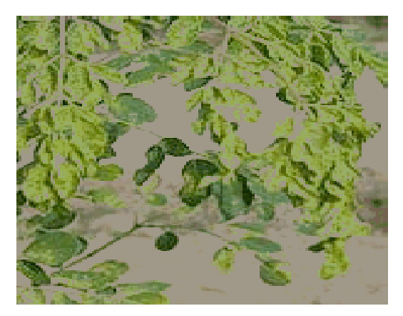
Fig 10

Cultivate the soil thoroughly before planting to suppress early weed growth. Maintain a weed-free planting by regularly cultivating between beds and rows. In high density or intensive production early weed control is critical and after that, weed control does not pose any serious treat to production. Moringa is resistant to most pests and diseases, but outbreaks may occur under high density cultivation conditions. Mite populations can increase during dry and cool weather. These pests create yellowing of leaves (Fig. 10), but plants usually recover during warm weather. Other insect pests include termites, aphids, leafminers, whiteflies, and caterpillars. Using neem seed preparation as foliar spray or commercial preparations containing Azadirachtin easily controls this problem. Chemical control of insect pests should be used only when severe infestations occur. Choose a pesticide that targets the specific pest causing the damage, and avoid pesticides that kill or inhibit the development of beneficial organisms. Choose pesticides that last only a few days. After spraying with pesticide the next leaf harvest should be delayed to avoid pesticide residual effect on leaves harvested.