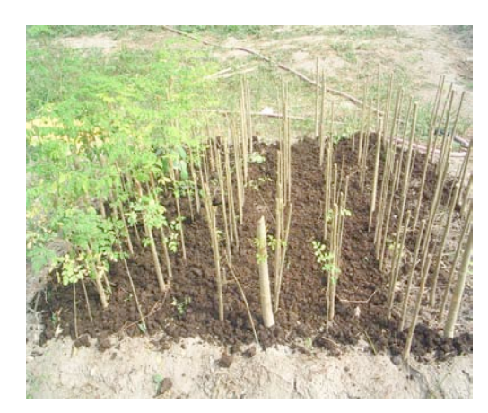
Fig 8 Compost Application

In high density cropping systems, the need to start with a very fertile soil is crucial. Large amounts of compost, well decomposed manure or mineral fertilizers will still be needed per hectare per year to maintain productivity at an appreciably high level. A systematic evaluation of the fertilizer requirement research is also needed. Sulphur containing foliar fertilizers is recommended especially when it is easily available as it appears to increase protein contents of the leaves harvested. However it must be applied when there are enough leaves on the plant to allow for easy assimilation of nutrients into the plant. By allowing enough time after the application before harvesting will give the plant enough time to utilize nutrients as well as avoid chemical residues that might still remain in the leaves. Grass or plastic mulching is equally possible which facilitates soil moisture conservation.