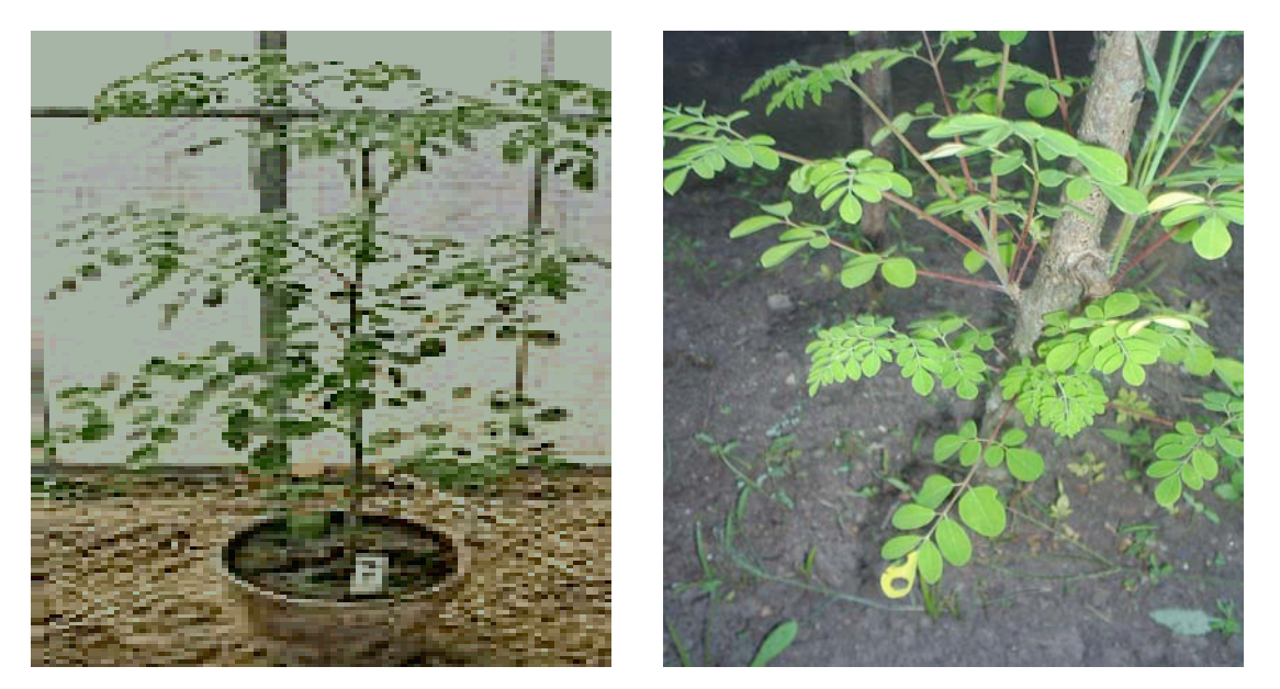
Fig.6 Potted Plant of MoringaFig 7. Rooted Cutting (45cm long)