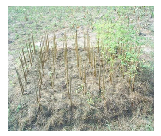
Fig 9 Grass Mulching

Newly transplanted trees must be irrigated immediately after transplanting to promote early root development. In dry and arid climates, irrigate regularly for the first two months. The well-rooted tree tolerates drought and needs irrigation only when persistent wilting is evident. Irrigate regularly to keep the soil moist but not wet. Intensively cultivated plants will demand more regular watering and fertilization. Mulching with grass can also be done to conserve moisture. (Figs. 8 and 9)