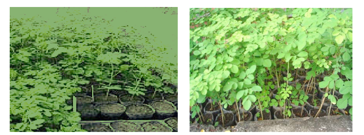
Fig 5a Young Seedlings in Polythene BagsFig 5b Young Seedlings inPolythene Bags

Seedling production. Seedlings can be grown in divided trays, individual pots or plastic bags (Figs. 5, 6). Use of divided trays and individual containers is preferred because there is less damage to seedlings when they are transplanted. Moringa is quite sensitive to transplanting shock that slows down the rate of initial growth. A 50-cell tray with cells 3–4 cm wide and deep is suitable. Fill the tray with a potting mix that has good water-holding capacity and good drainage.