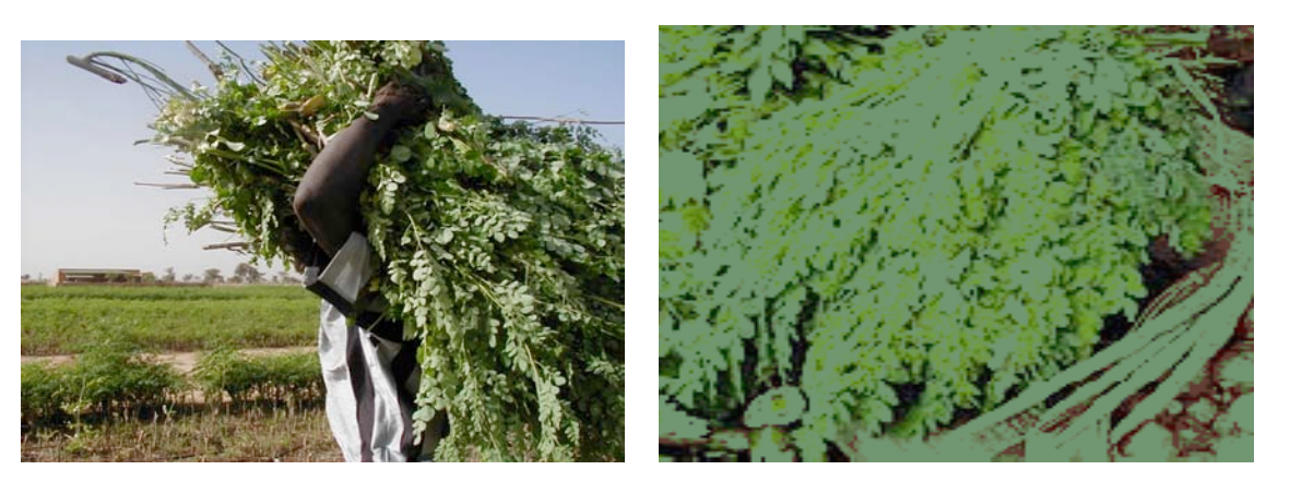
Fig 15 Moringa shoots being carried after harvest leaves tied (Courtesy C. Olivier 2005 in Senegal)