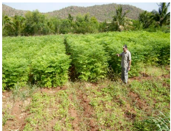
Fig 14b Harvests