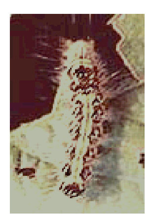
Fig 11 Courtesy AVRDC

The roots of moringa are adapted for water storage and termites find it very convenient in attacking moringa roots in search of water. In soils that are heavily infested with termites their control may not be economical. Such soils should therefore be avoided as much as during site selection. Cattle, sheep, pigs, goats, antelopes, rats and mole rats will eat