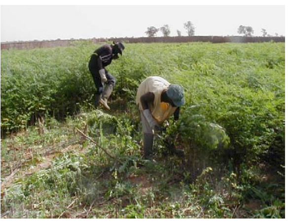
Fig 12a Manual Harvesting with a Sickle Sickle (Courtesy C.Olivier 2005 in Senegal)