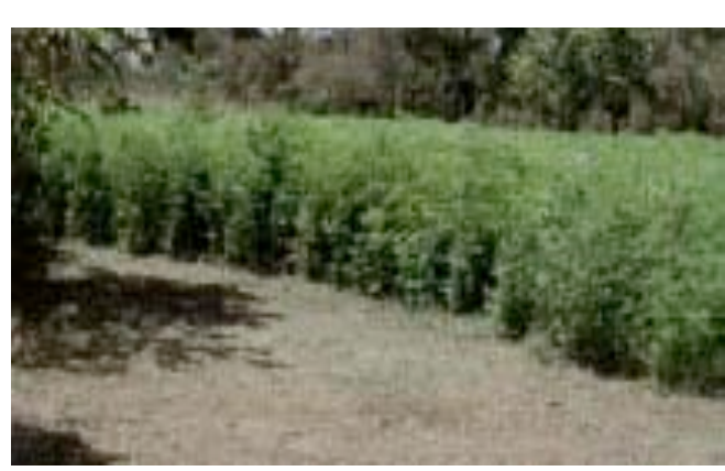
Fig 1. Moringa as a Backyard tree